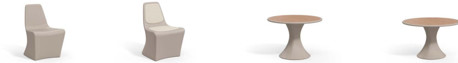
FLC121A Dining Chair